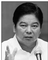
Governor Amando Tetangco Jr.

"The demand for our workers in certain sectors in affected