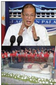
Pres. Aquino (top photo) and the remains of Marcos in Ilocos Norte

A military court during the Marcos regime sentenced Aquino's late father and name-