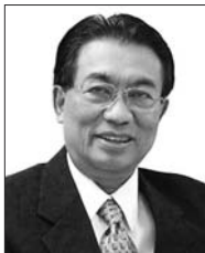
Health Secretary Enrique Ona

The four-day WHO meeting discussed current health issues in the region like dengue, antimicrobial resistance, tradi-