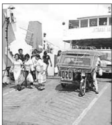
A Ro-Ro port in Bacolod

pines has already spent billions of pesos in litigation costs alone against the German firm Fraport over the Ninoy Aquino International Airport Terminal 3 project.