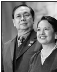
The Arroyos, Mike and Gloria

Last month, Budget Secretary Florencio Abad said that at least two major cases may be filed against former President Arroyo before December. He issued the statement amid calls