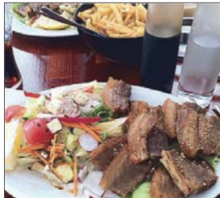
Lechon kawali, Iceland-style