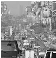
Air pollution from the transport sector

countries with rampant malaria cases in the region have already formulated national elimination plans.