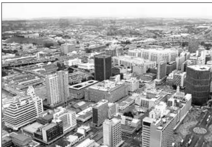
Johannesburg, which means Land of Gold, is only a three-hour drive away from Waterberg region.