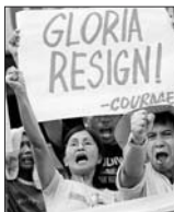
GMA needs a lot of praying. They trusted her then (EDSA 2001), hated her now.

A lmost nine years after the EDSA II Revolution, the non-violent uprising which first swept Philippine President Gloria Macapagal-Arroyo into power, and five years after the controversial 2004 presidential elections which saw the defeat of popular candidate Fernando Poe Jr., the current president remains steadfastly in power.