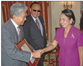
Philippine President Gloria Macapagal Arroyo congratulates Sen. Daniel Akaka (left) and Sen. Daniel Inouye (middle) for their support of Filipino WWII veterans."

Philippines President Gloria Macapagal Arroyo presented U.S. Senators Daniel K. Akaka and Daniel K. Inouye with a Presidential citation expressing appreciation for their work for Filipino World War II veterans.