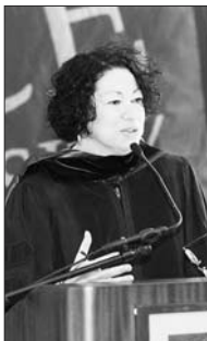
US Supreme Court Justice Sonia Sotomayor

Judge Sotomayor's academic qualifications have been as stellar as any white male. If not for her ethnic extraction, she would instead be lauded as extremely well-qualified and well suited for a place on the nation's highest court. She graduated as valedictorian from her Catholic primary school class with a near-perfect attendance record. She went on to graduate as valedictorian of her high school class as well, having been elected to its student government and being a member of its forensics team.