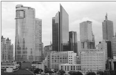
The Arroyo administration proudly asserts that one of its achievements is having created a strong Philippine economy that was able to weather the global financial and economic crisis. Critics think otherwise and point to the number of people still living in poverty as proof of the administration's failure in creating sound economic policies.

In fact, according to research conducted by the Philippine Daily Inquirer, President Arroyo's performance and trust ratings have been on a downhill slide after 2004. The report notes that her performance and trust ratings have deteriorated