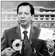
Outgoing Secretary Ignacio Bunye

He said the job of spokesman and press secretary requires one to wake up very early to "greet that news cycle as it begins and having