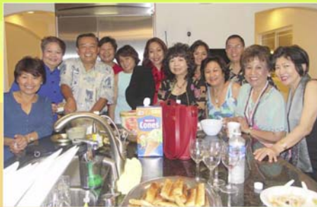
USTAAH members and guests during the dinner reception