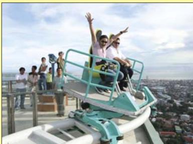
The world's first Edge Coaster thrill ride of Crown Regency Hotel and Towers in Cebu City

The country is within the Pacific typhoon belt, so most of the archipelago experiences torrential rains and storms between July and October. It makes sense to avoid these months, especially if you're vacationing in Luzon or in the Visayas. When visiting during the Christmas season or the Roman Catholic Holy Week, be aware that most of the people, especially in the big cities,