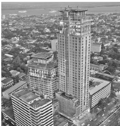
At 38 floors, the Crown Regency Hotel and Towers in Cebu City is the tallest building outside Metropolitan Manila.

FURTHER south in Mindanao, Surigao del Norte's Siargao island is the place to go. The Philippines' surfing capital is a superb venue for international surfing competitions because its waves have been ranked among the top five breaks in the world. It features the "Cloud 9" wave, considered as one of