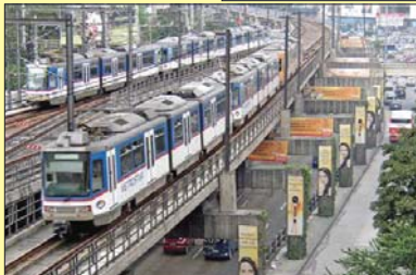
Around Manila, take your pick: MRT or a jeepney (top right)