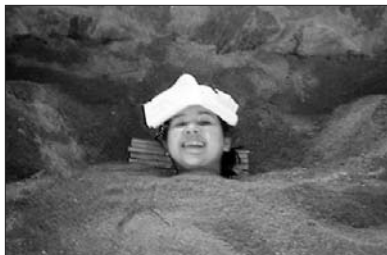
The Pinatubo Spa Town in Sta. Juliana, Tarlac offers therapeutic volcanic ash body treatment.

backdrop of rolling hills and mountainsides, the spa offers ultimate pampering through its signature volcanic ash spa treatment. The therapy involves covering the body up to the neck with salt and sulfur volcanic ash, which are said to help detoxify the body. This is followed by a massage that combines Filipino, Thai and Shiatsu massage techniques.