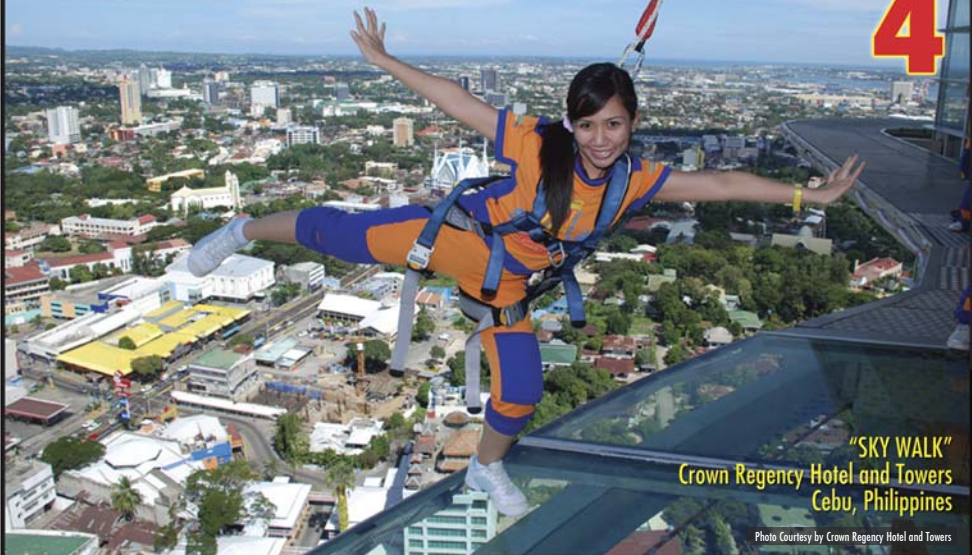
"SKY WALK" Crown Regency Hotel and Towers Cebu, Philippines