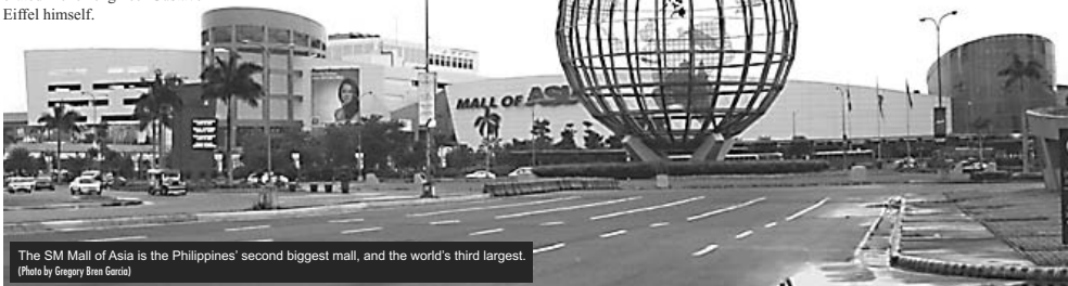
The SM Mall of Asia is the Philippines' second biggest mall, and the world's third largest.