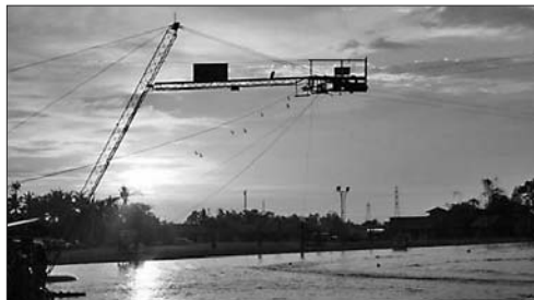
The Camsur Watersports Complex in Camarines Sur province offers world-class cable facilities that draws in water sports enthusiasts from all over the world.

Nestled in the Provincial Capitol Complex in the town of Pili, Camsur Watersports Com-