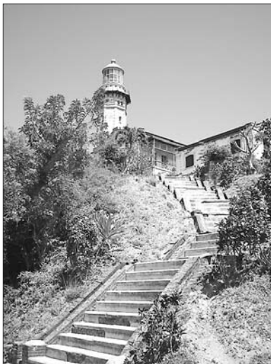
The Cape Bojeador Lighthouse built in 1892 in Burgos, Ilocos Norte, still stands guard today over the South China Sea.

On your way to the beaches, try to fit into