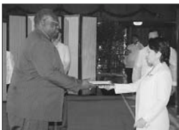
New United States Ambassador to the Philippines Harry K. Thomas Jr. presented his credentials to President Gloria Macapagal-Arroyo at Malacañang Palace.

In the interview posted on the CSIS website on Monday, Thomas congratulated the Fil-