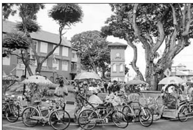
Viva Malacca: The colorful streets of Malacca, particularly the Dutch Square invites tourists to explore amazing attractions such as the Stadhuys, the Tan Beng Swee Clock Tower, Queen Victoria Fountain and Christ Church

At the Baba-Nyonya Heritage Museum which was a stunning ancestral home that preserves the legacy of three generations of a Straits-born Chinese Baba family, there's this woman who pretty much got all her spicels ready. Her story-telling and peculiar speaking voice was just unforgettable. I pretty much remember her saying that the Babas were a combination of the Chinese and Malay culture, a result of marriages between early Chinese settlers and local Malay women. On the house's second floor there was this small opening from which you could take a peek at everything happening under. The purpose