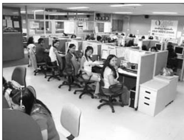
Business Process Outsourcing in the Philippines

The continuing reforms and policies have firmly put the Philippines on a path to stability and growth which has maintained momentum in foreign investment, Fung says. ( Good News Pilipinas )