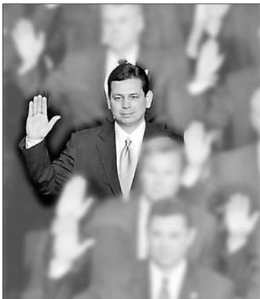
U.S. Rep. Steve Austria's oath-taking

also pushing for more protection for our keiki.