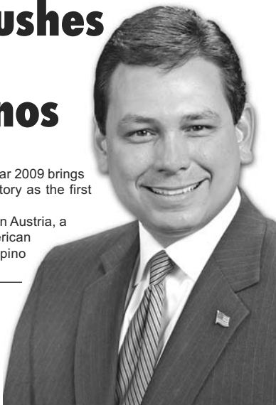
U.S. Representative Steve Austria

Looking back at his humble beginnings, it seemed politics was an unlikely career choice for Austria. His first job was