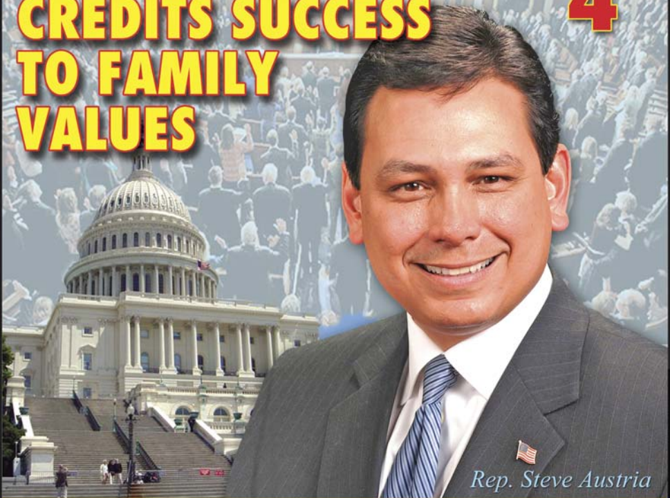
Rep. Steve Austria