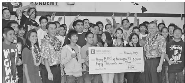
Island Insurance executives present a check for $50,000 to students at Farrington High School during their Engineering Academy student induction ceremony on February 13, 2009.

Island Insurance Company, Ltd. is Hawaii's largest locally owned and managed insurance carrier and offers a full range of property and casualty protection.