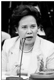
Sen. Miriam Defensor-Santiago

Santiago, Senate foreign affairs committee chair, said Mrs. Arroyo should sign the bill to