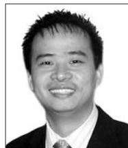
Cong. Joel Villanueva

"The Constitution provides that amendments be approved by a three-fourths vote of all members of Congress," he said.