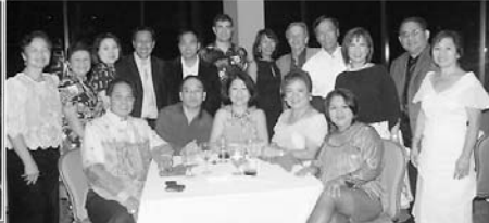
▶ The PMAH recently held its quarterly meeting & CME at Turtle Bay Hotel during the Memorial Day weekend. Shown here are some members and spouses during the family night