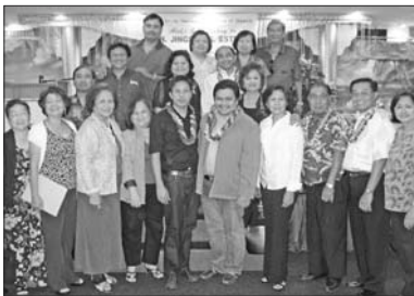
Phil. Senator Jinggoy Estrada with community leaders