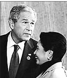
US President George W. Bush with Philippine President Gloria Macapagal-Arroyo

The President will also meet with the Philippines-US Friendship Caucus, a group composed of members of the House of Representatives particularly interested in strengthening relations between the Philippines and the United States.