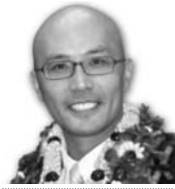
by Senator Will ESPERO

A couple of years ago, TIME magazine noted that high gas prices would succeed where all other efforts failed in persuading Americans to conserve gas when driving. TIME was right. In the last several weeks, the morning commute to town has shortened dramatically, even without school breaks, as residents adopted other ways to save at the pump. Carpool, Van-pool, TheBoat, TheBus, bicycle, motorcycles and motor scooters, and moving closer to your job — these are all ways that people have switched to in the effort to survive the climbing prices of gas.