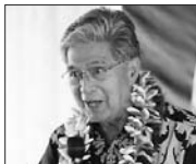
US Sen. Daniel Akaka

A vote on the proposal is pending in the US House after the US Senate passed it in April. The House is expected to take action on it this year.