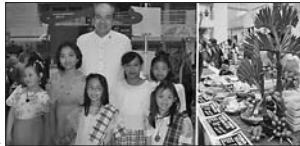
Left picture: Ambassador Arguelles poses with children of Embassy staff wearing Philippine costumes; Right picture: Native delicacies such as kakanin prepared "turo-turo" style at the ASEAN Food and Cultural fair

The event drew over 1,000 visitors who mingled and tried the variety of Southeast Asian food. The Dutch, as well as other foreign visitors, were particularly attracted to the appetizing array of Filipino food which included